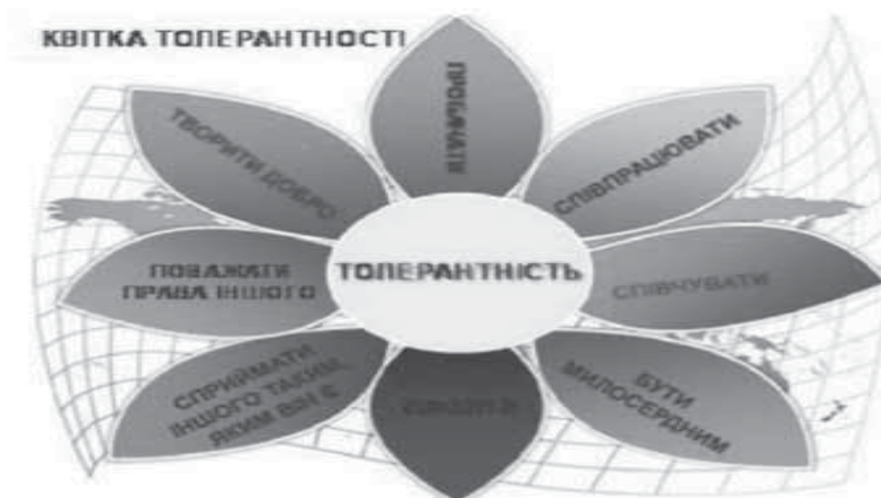
Pic. 1. Associative flower

II. The game «Associative flower» (pic. 1.) Try to fill an associative tolerance flower. Tell the trait inherent tolerant person. Students (pupils) paint a flower, in turn, called the trait and go record it.